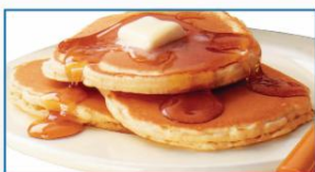
GLUTEN FREE PANCAKES

In preparation of the cooking demonstration, recipe ingredients are listed below.