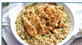
QUINOA IMMUNE BOOSTER WITH CHICKEN BREAST

1 cup gluten free flour ½ teaspoon baking soda ½ teaspoon cinnamon 1 egg 1 tablespoon vegetable oil 1 teaspoon vanilla ½ cup milk or more