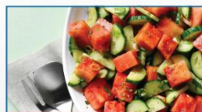
WATERMELON CUCUMBER SALAD

Orange Juice Bell Peppers Spinach Broccoli Ginger Garlic Poultry (Chicken) Quinoa Turmeric Grapeseed Oil